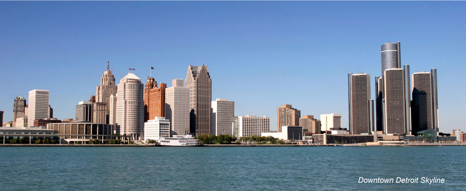
Downtown Detroit Skyline